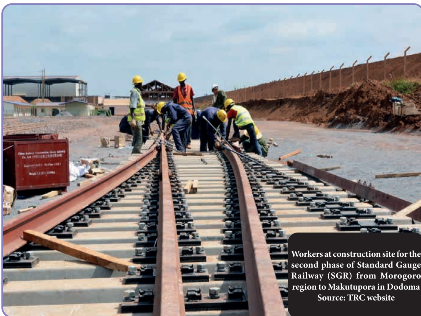
Workers at construction site for the second phase of Standard Gauge Railway (SGR) from Morogoro region to Makutupora in Dodoma

Maximum number of days given to a procuring entity to submit to PPRA, a proposal for blacklisting a tenderer from participating in public procurement, after establishing grounds for blacklisting.